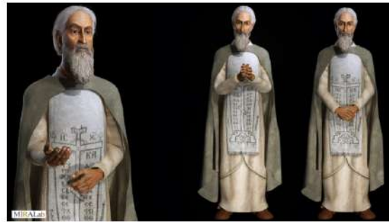
The avatar of Saint Neophytos created by MIRALab of the University of Geneva

The most interesting presentation is the digital revival of the Enclave of Saint Neophytos in Tala, Paphos. The project, developed within the framework of Eureka3D-XR, uses 3D imaging, AI and XR technologies to allow Saint Neophytos to appear before visitors in full 3D and interact with them.