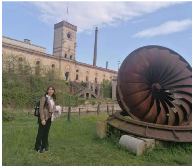
Pic 2: Turbine and old cotton mill.

The main need is to cultivate a more welcoming attitude towards tourists among residents, but this cannot be achieved without showing tourists their responsibilities in guaranteeing residents' privacy and in keeping the place clean and quiet. Therefore, it was decided to provide tourists with a series of recommendations on how to behave during their visit, along with information on the main attractions.