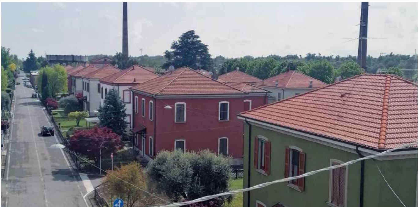
Pic 1: view of Crespi village.

As part of the TExTOUR project, several meetings were held with the main stakeholders active on the territory to find a way to manage tourism fluxes ensuring a harmonic development of cultural tourism in Crespi D'Adda. In the end, the idea to write a Vademecum arose to educate both tourists and residents , building together the foundations for a fruitful coexistence.