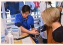
Investments on the rise in healthcare