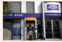
Moody's: Hellenic Bank ratings on review for upgrade