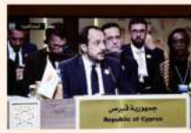
From threat to opportunity