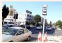
Red light traffic fines to be reduced