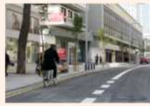
CCLEI 'marginally positive' in May