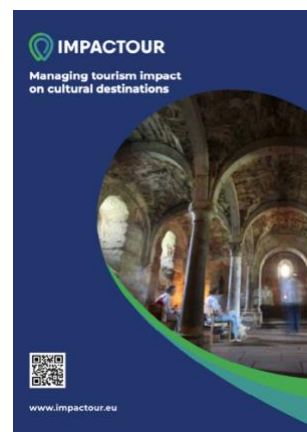
IMPACTOUR Brochure no. 2 (A5 size, 6 pages)