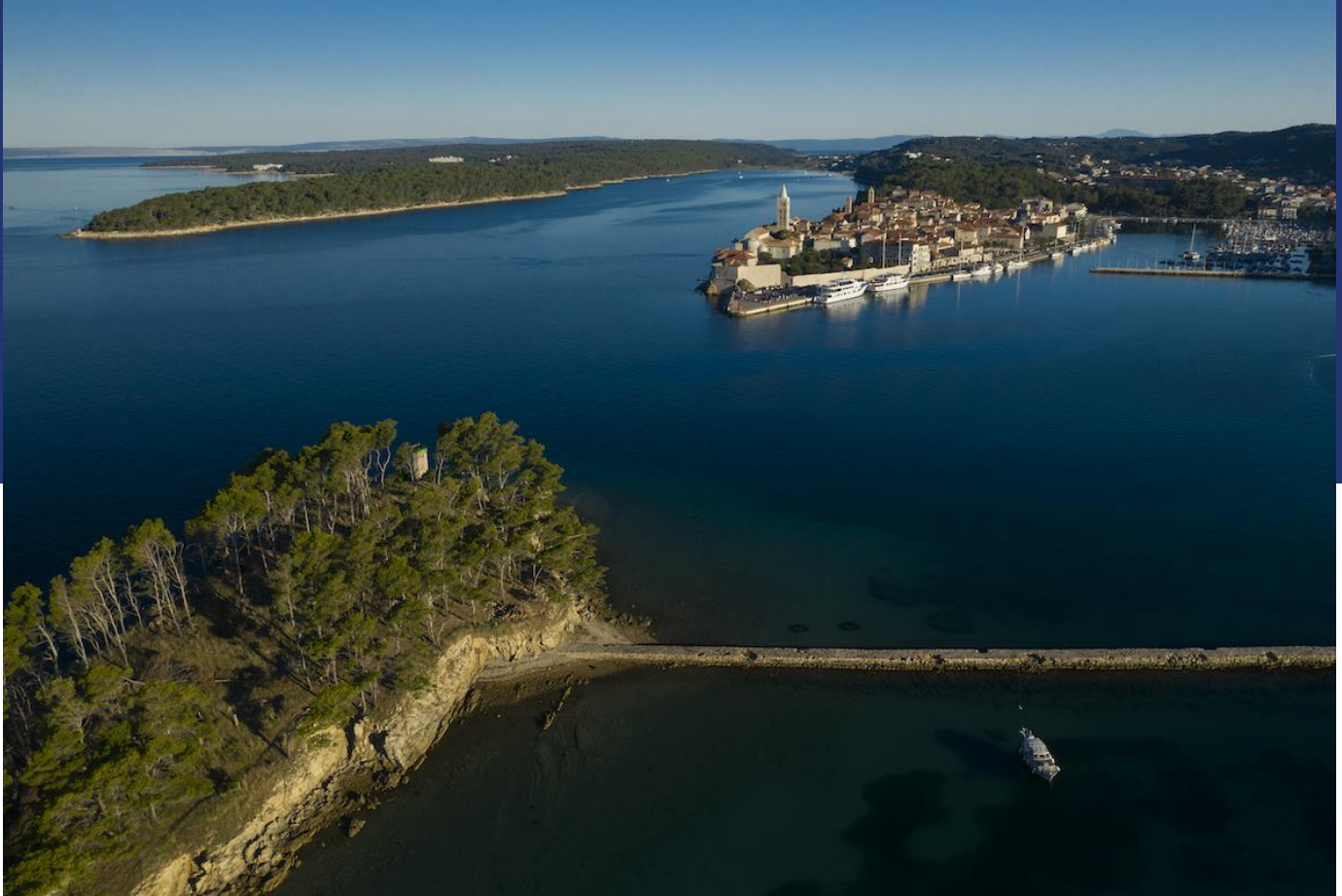
Rab, Croatia.

IMproving Sustainable Development Policies and Practices to access, diversify and foster Cultural TOURism in European regions and areas