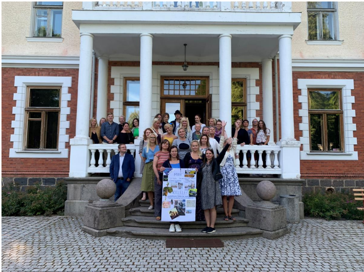
Team

Visit Estonia's (Estonian Tourist Board) great aim is to raise curiosity in travellers from near and far, and to have them come and discover this little country. At the same time, we also want to make sure that Estonian tourism products are internationally competitive for our visitors to feel good. Visit Estonia is made up of more than 30 people with a mission. They work in 3 teams, one that looks after the end consumer, one that interacts with the travel trade, and one that deals with development questions. They work closely together to give their home country an advantage it deserves.