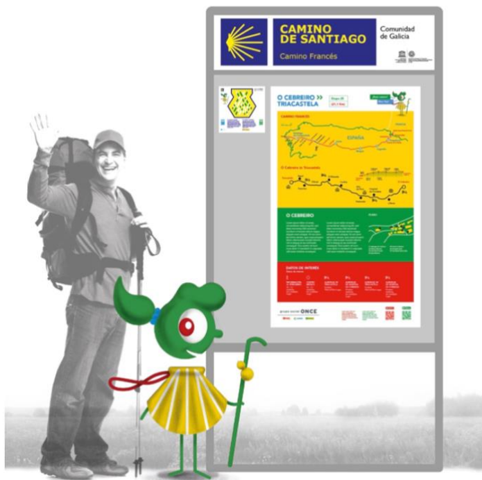
Image: From the Way of Saint James project. Proposed signage with placement of the "VuMark" digital code, which pilgrims can scan to receive information via their mobile device.