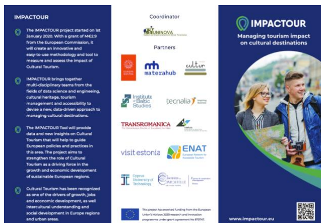
IMPACTOUR Brochure no.1 (A4 size, 2 pages)

Download the brochures in PDF from these links: