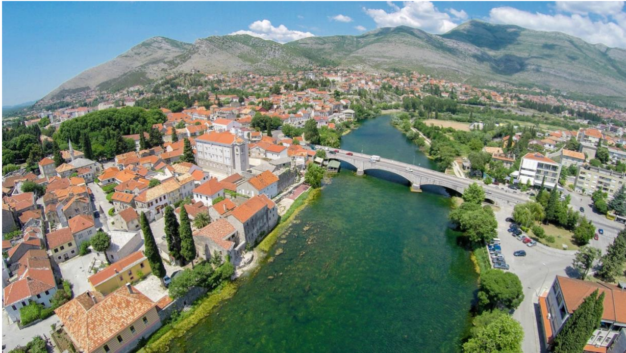
Trebinje, Bósnia-Herzegovina

The IMPACTOUR project is currently collaborating with a number of Pilot Sites around Europe. These sites will provide a range of data on visitor flows, cultural assets, infrastructure provisions, economic and social indicators, helping to define, build and eventually test the new IMPACTOUR tools for destination management. Additional sites will be coming on-stream in the next weeks.