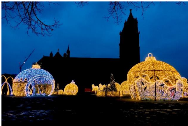
"World of Light" in front of Magdeburg Cathedral