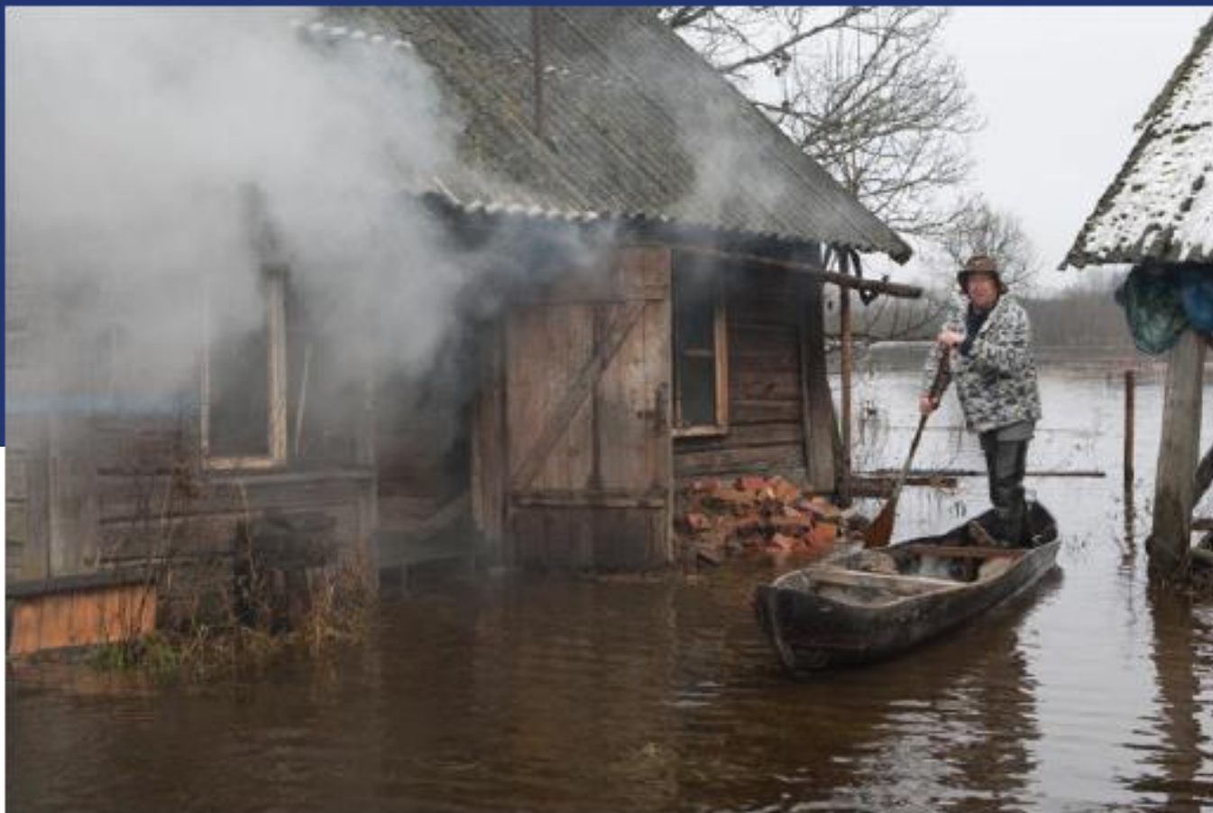
Seto culture from Võru County. #VisitEstonia

Improving Sustainable Development Policies and Practices to access, diversify and foster Cultural TOURism in European regions and areas