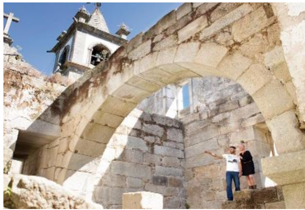
Visit of the Monastery of Ancede in Baião

Since 2007, TRANSROMANICA has been certified as a Cultural Route of the Council of Europe continuously providing a concrete demonstration of the fundamental principles of the Council of Europe: human rights, cultural democracy, cultural diversity and identity, dialogue, mutual exchange and enrichment across boundaries and centuries.