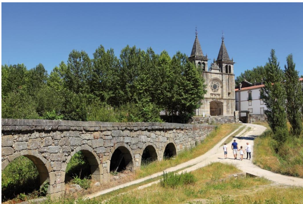
Monastery of Pombeiro, Felgueiras.